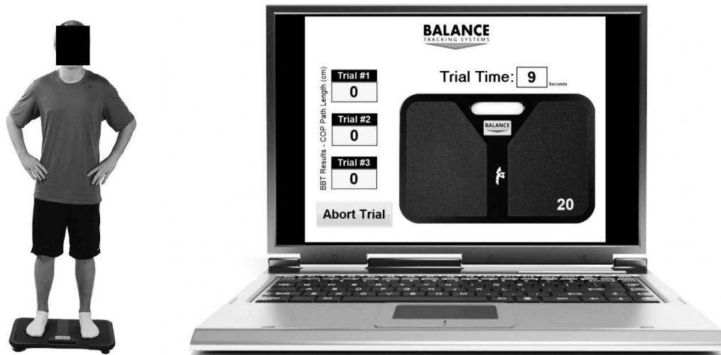
Figure 1. Depiction of the BTrackS Balance Test testing setup. Athletes stood as on the left with eyes closed, hands on hips, and 2 feet on the BTrackS Balance Plate (Balance Tracking Systems, Inc, San Diego, CA). During testing, the BTrackS Sport Balance software shown on the right guided the tester through measurement of center-of-pressure path length. In this screen shot, the first of 3 trials is in progress with a center-of-pressure path length of 20 shown on the BTrackS Balance Plate image.

reflect malingering but rather latent neuromuscular concerns from previous concussions or musculoskeletal injuries.